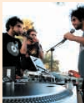
"Ramallah Underground" Coming 2009 Taybeh Oktoberfest