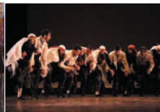
Oktoberfest 2008 Sarab For Dance