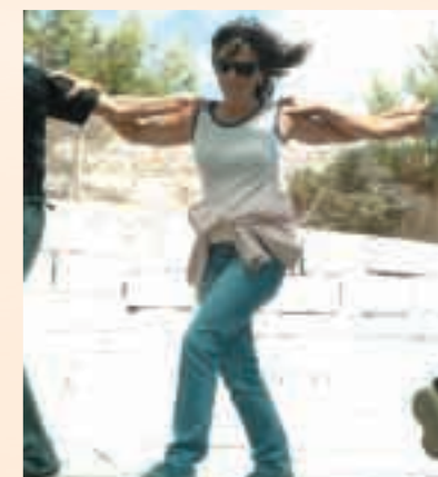
Come dance at the Oktoberfest as if no one is watching!