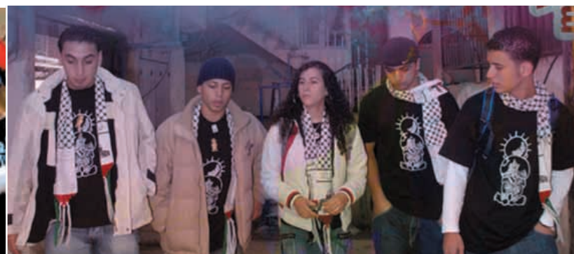
Oktoberfest 2007 G-Town: The Palestinian Hip Hop Makers