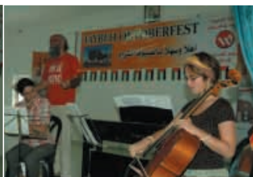
Oktoberfest 2005 Al Kamandjati Music