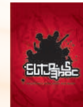
CULTURESHOC The first Palestinian Rock-Rap Band

Oktoberfest traditionally starts in the 3rd weekend in September and ends the 1st Sunday of October.