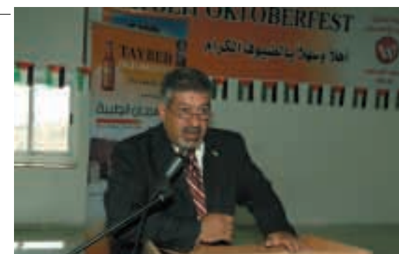
Honorable David Canaan Khoury Mayor of Taybeh