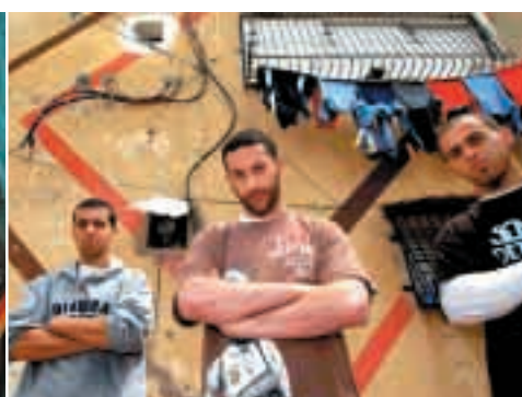
Oktoberfest 2006 DAM Hip Hop Palestinian Music