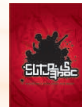
CULTURESHOC The first Palestinian Rock-Rap Band

Oktoberfest traditionally starts in the 3rd weekend in September and ends the 1st Sunday of October.