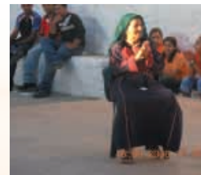
Come sing at the Oktoberfest as if no one is listening!

If you come to Taybeh you might feel the hospitality and warmth that Saladin must have felt in the late 12th century when he called the people "Taybeen," actually initiating the name change from Biblical Ephraim to Taybeh for this tiny place that welcomes you for a day of fun, food and Taybeh Beer.