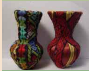
Embroidered Vase 25 NIS