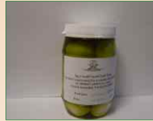
Lebaneh (yogurt) 12 NIS