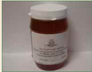
Pure Honey 50 NIS