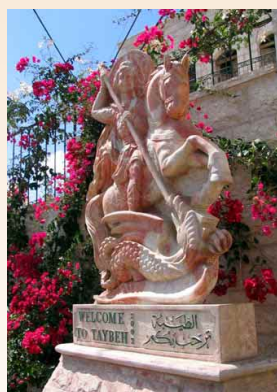
Saint George, Patron Saint of Taybeh