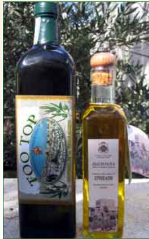
Taybeh Olive Oil Taybeh Olive Press 25 NIS