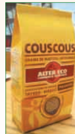
Maftoul (couscous) 15 NIS

Special Luncheon Discussion on Marketing Strategies, Oct 1st, 1:00 p.m - 2:30 p.m.