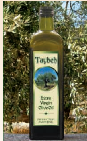
Taybeh Extra Virgin Olive Oil 25 NIS