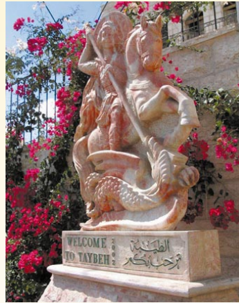
Saint George, Patron Saint of Taybeh

Taybeh Municipality Taybeh Brewing Company Olive Branch Foundation Local Clergy Taybeh Women's Benevolent Society Ladies Organization of Taybeh Taybeh Cooperation for Country Development Taybeh Scouts Society of Christian Heritage in the Holy Land