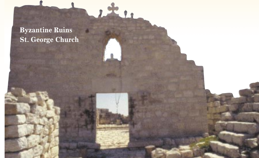
Byzantine Ruins St. George Church