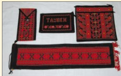
Hand Made Embroidery