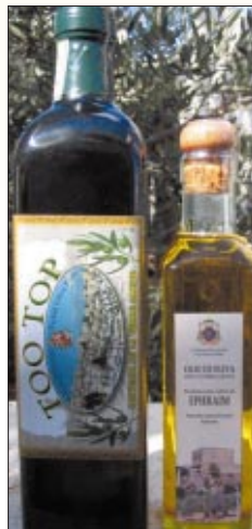
Taybeh Olive Oil Taybeh Olive Press