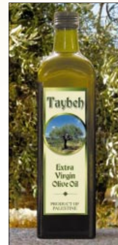
Taybeh Extra Virgin Olive Oil

Special Luncheon Discussion on Small Business