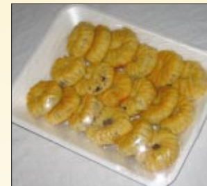
Sweets filled with dates